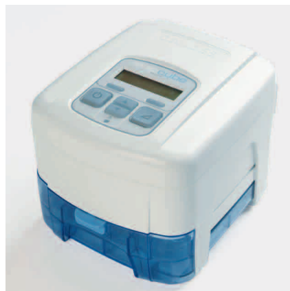
SleepCube with integrated heated humidifier