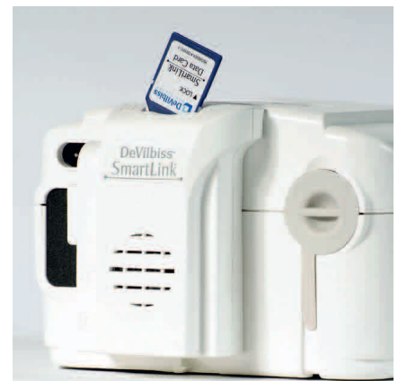
SleepCube AutoBilevel with SmartLink unit attached